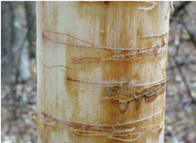
Figure 26. EAB galleries in black ash (Michigan).