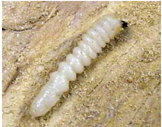
Figure 11. Cerambycid larva.

Galleries and/or larvae of cerambycid species were found in ~10% of 1800+ sampled trees during MDA detection tree surveys in 2007-2008.