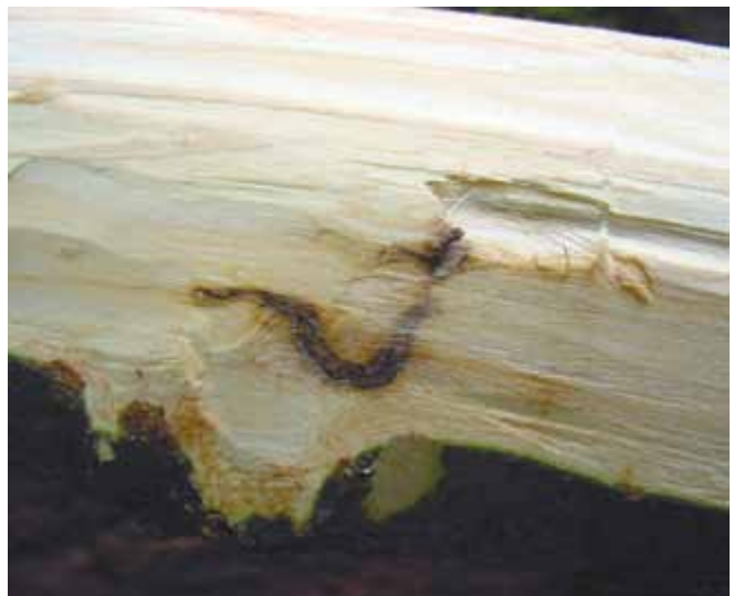
Figure 19. Early Chrysobothris gallery.