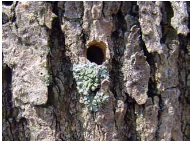
Figure 20. Clearwing moth emergence hole (about size of pencil eraser, picture from Michigan).

Galleries and/or larvae of clearwing borers, Podesia spp. (Lepidoptera: Sessiidae) were found in ~10% of sampled trees during MDA detection tree surveys in 2007-2008. The galleries in Figures 21, 23 and 24 are approximately the width of a felt-tip marker and deeply etched into the sapwood. Clearwing borers tunnel deeply into the wood as larvae and leave large round holes when they emerge as adults. Clearwing borer larvae have legs, distinguishing them from roundheaded and flatheaded borers.