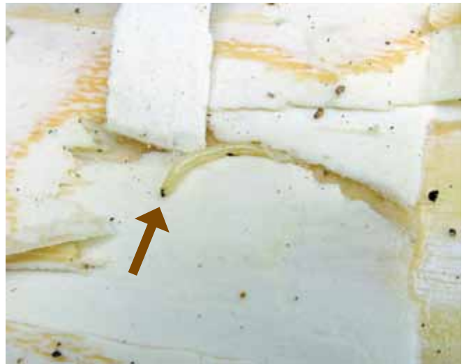
Figure 6. Larva of ash cambium miner.

During 2007-2008 EAB detection tree surveys, evidence of ash cambium miner was found in ~30% of 1800+ sampled trees.