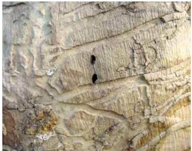
Figure 13. Close up of figure 12 showing holes tunneled into wood.