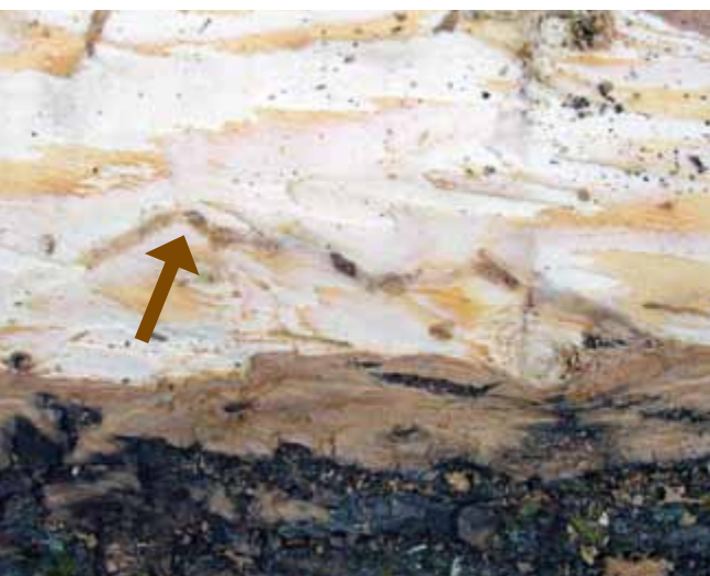
Figure 9. Gallery of ash cambium miner just beginning to show as phloem is scraped away.