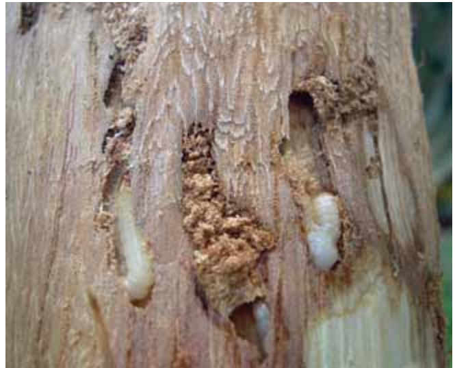
Figure 22. Clearwing moth larvae.