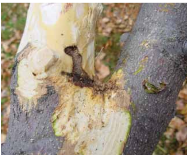
Figure 23. Clearwing moth gallery at branch crotch.