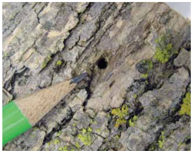
Figure 15. Emergence hole of redheaded ash borer.