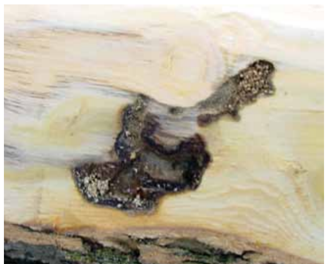
Figure 24. Clearwing moth gallery.