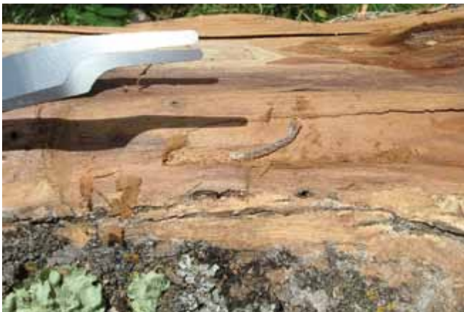
Figure 16. Chrysobothris larva on black ash.

Three genera of buprestids can be found boring in ash trees in Minnesota - Agrilus (EAB), Chrysobothris and Dicerca . Damage from Chrysobothris and Dicerca is similar and can be easily distinguished from that of Agrilus . During 2007-2008 EAB detection tree surveys, damage and larvae from Chrysobothris and Dicerca were found in ~10% of 1800+ sampled trees. The vast majority of larvae recovered from trees were Chrysobothris spp., though Dicerca was also represented. Two Chrysobothris adults were recovered from one tree and identified as C. sexignata . Chrysobothris and Dicerca galleries are not tightly "S"-shaped though they are sometimes sinuous in shape.