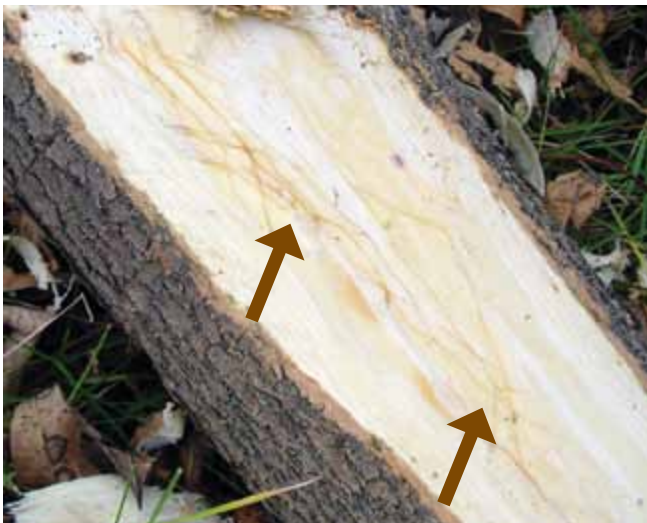
Figure 7. Galleries of ash cambium miner.