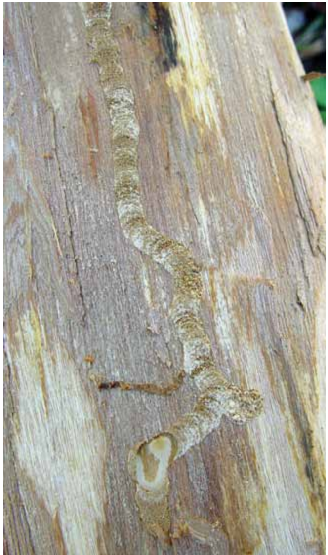
Figure 17. Chrysobothris larva and gallery in black ash.