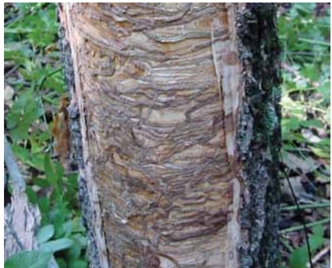
Figure 29. Old EAB infestation (Ohio).