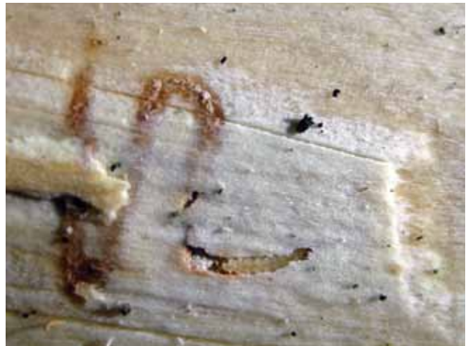
Figure 25. First instar EAB larva and gallery (about size of a dime).

Find out where EAB has been found in Minnesota: www.mda.state.mn.us/invasives/eab