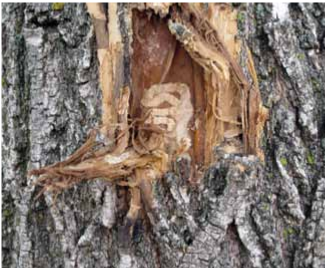
Figure 28. EAB gallery found beneath a woodpecker feeding site.