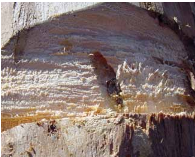
Figure 14. Pupal chamber of a Cerambycid larva deep in wood.