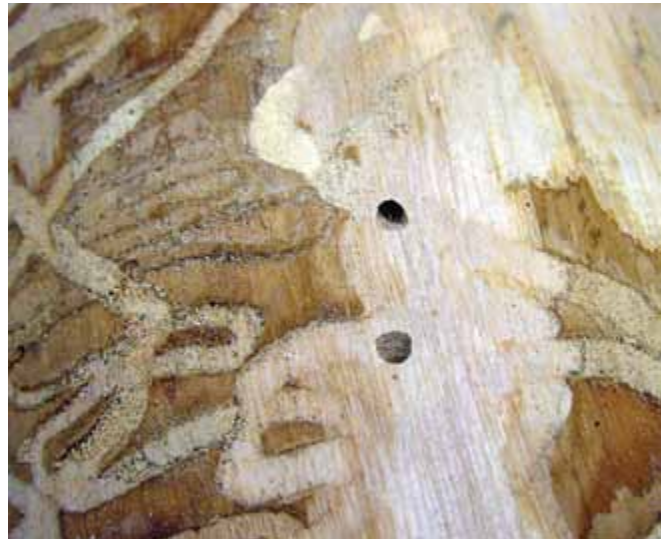
Figure 27. “D”-shaped emergence holes in de-barked wood (Michigan).