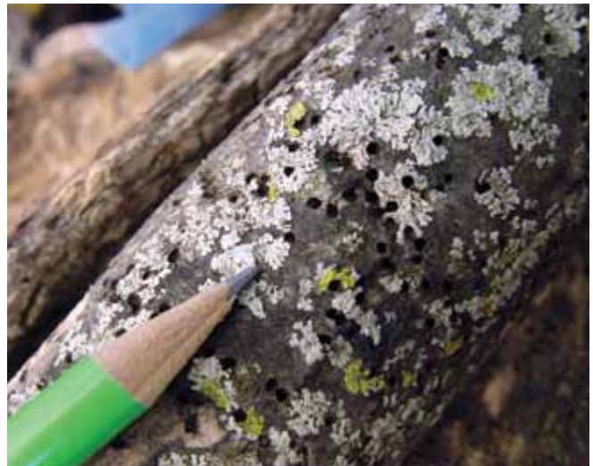
Figure 1. Bark beetle emergence holes.

During 2007-2008 EAB detection tree surveys, ash bark beetles ( Hylesinus spp.) were found in ~70% of 1800+ ash trees sampled by Minnesota Department of Agriculture (MDA) across the state.