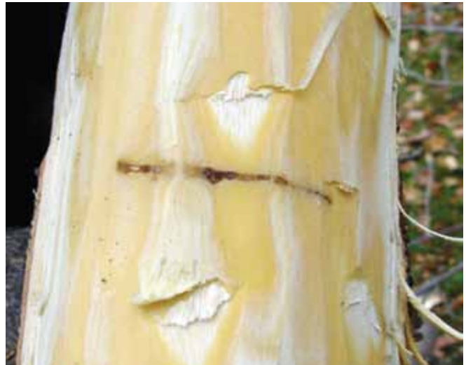
Figure 3. Bark beetle egg-laying galleries cross the grain of the wood.