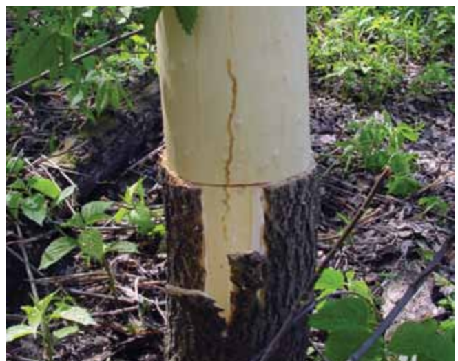
Figure 10. Gallery of ash cambium miner already present when tree girdled.