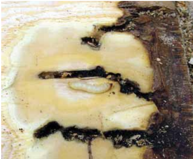
Figure 21. Clearwing moth gallery starting at girdle.