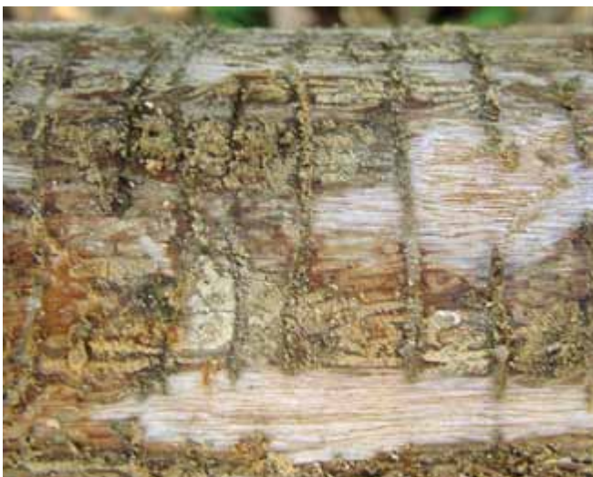
Figure 4. Larval galleries lie at right angles to egg-laying galleries and are often very closely spaced.