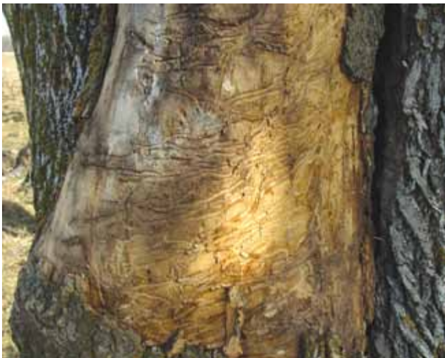
Figure 12. High-density infestation of Cerambycid larvae – there is some similarity in appearance to a older EAB infestation.