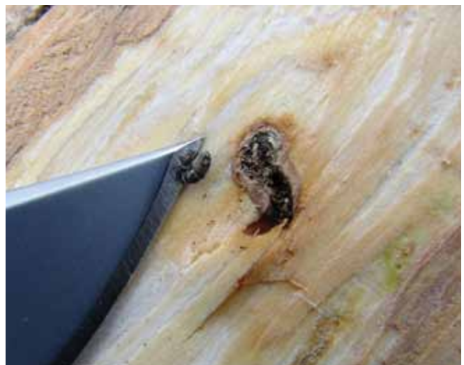
Figure 5. Adult ash bark beetle at knife tip next to gallery.