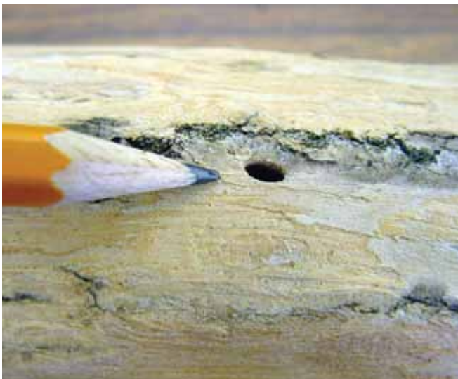
Figure 18. Chrysobothris emergence hole.