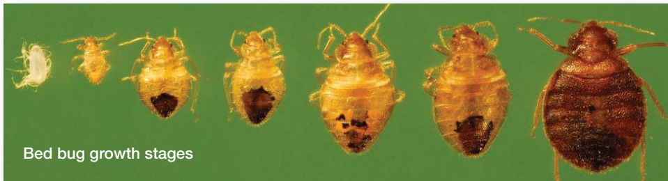
Bed bug growth stages