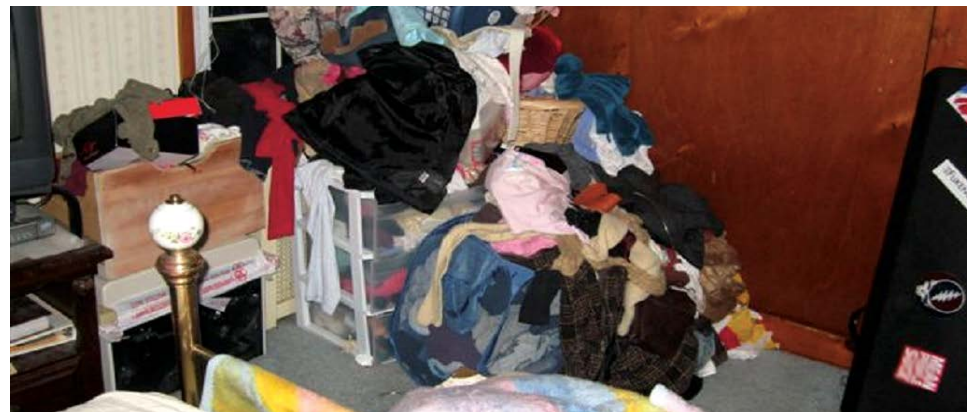
Clutter provides hiding places for bed bugs and is a barrier to successful treatments.

Hire a licensed, experienced and reputable pest management professional. See "Hiring a Pest Management Professional" found at the Let's Beat the Bug! webpage listed under "Additional Resources."