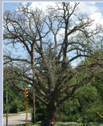
Gypsy moth defoliated this oak tree.

Since 1973, the State of Minnesota has been actively surveying for gypsy moth. Our first gypsy moth eradication project was conducted in 1980. Since that time, and in partnership with the federal Slow the Spread program, over a million acres have been treated in Minnesota to eradicate or slow advancing gypsy moth populations. In recent history, treatments have been conducted throughout the Twin Cities metro area, including an area of Grant in 2011