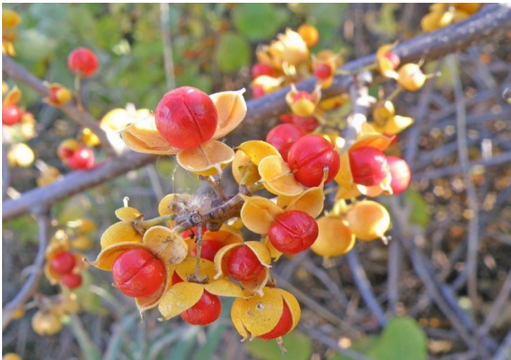
Photo caption: Red fruit and yellow capsules.