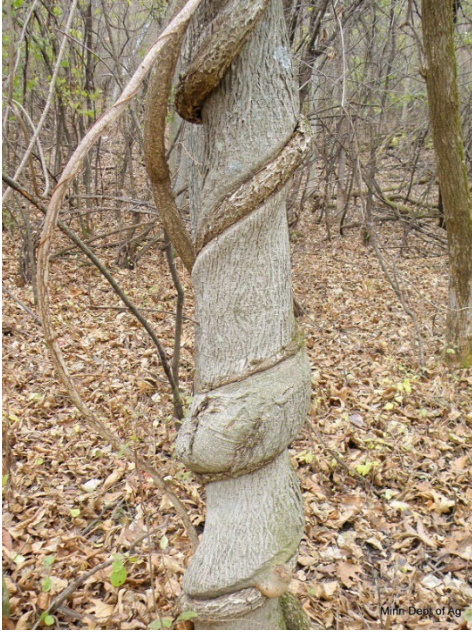
Photo caption: Vine girdling a tree.