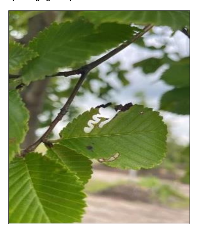
Figure 2. Zigzag feeding pattern on an elm leaf caused by elm zigzag sawfly.

EZS belong to the Agridae family in the order Hymenoptera. They feed exclusively on elm trees ( Ulmus spp. ) and can complete several generations per year. They are easily identified by the zigzag pattern they leave while feeding on the leaves. The impact of EZS and effective management strategies are currently unknown. This insect has been found in several states on the east coast and as close as Ohio.