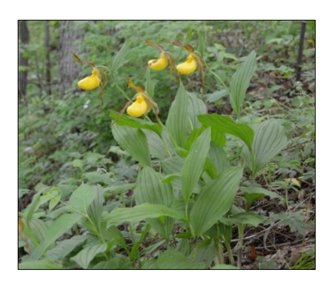
Figure 3. Lady slipper wildflowers.

To protect the state flower and other endangered wildflowers, Minnesota Statute 18H.18 Conservation of Certain Wildflowers prohibits the sale of certain wildflowers without written permission from the property owner and a permit from the MDA. Protected plants must be cultivated for a minimum period of one growing season and cannot be sold directly after being collected. In 2024, three permits were issued.