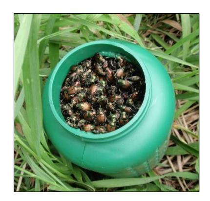
Figure 4. Japanese beetles in a trap.

Upon completion of the compliance agreement, Certificates of Quarantine Compliance (CQC) are issued, detailing the certification methods used. These certificates must accompany shipments to Japanese beetle-regulated states.