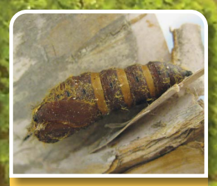
PUPA PUPATES FOR 2 WEEKS