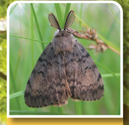
ADULT MALE DAYTIME FLIER