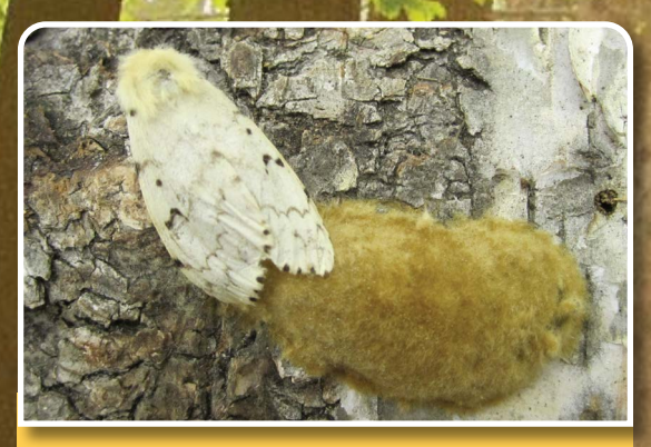
ADULT FEMALE WITH EGG MASS