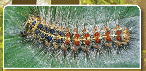
LATE INSTAR LARVA FEEDS 5-6 WEEKS