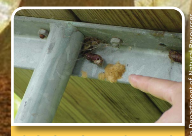
SPONGY MOTH HITCHHIKING ON A PICNIC TABLE