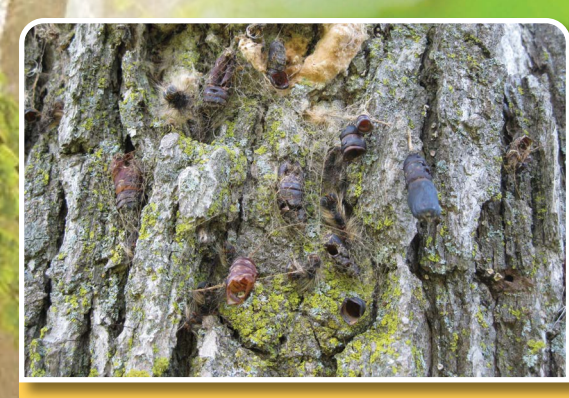
MULTIPLE SPONGY MOTH LIFE STAGES ON A TREE