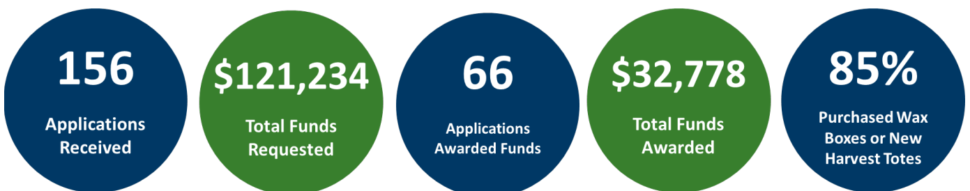
Figure 3: Produce Safety Mini-Grant by the numbers in 2023.

The Produce Safety Program mini-grant, funded through the USDA Specialty Crop Block Grant, offers awarded growers funding on a reimbursement basis for the purchase of eligible expenses. The expenses most submitted for reimbursement included wax boxes, harvest totes and harvest collection tools. As described in Figure 3, 156 applications were received totaling $121,234 funds requested. Of those applications, 66 were awarded funds totaling $32,770, and 85% of the awardees purchased wax boxes or new harvest totes with those funds.