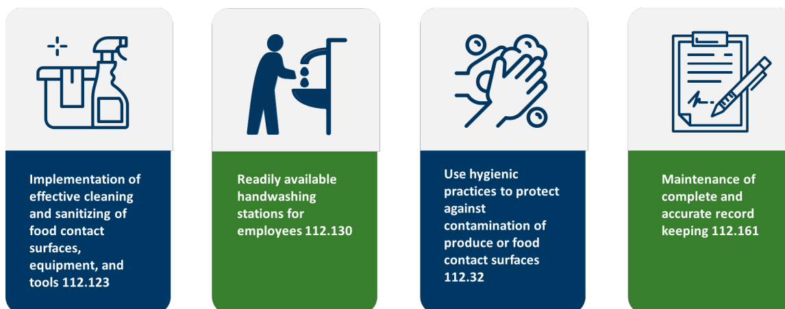
Figure 1. The most frequently cited observations from all inspections completed in 2023.