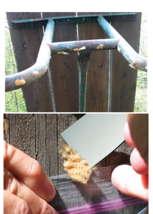
Egg masses found on picnic table.

gypsy moths to: www.mda.state.mn.us/arrestthepest 888-545-6684