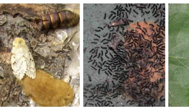
A mated female lays one egg mass just days after emerging from her pupal case

Egg mass with newly hatched caterpillars