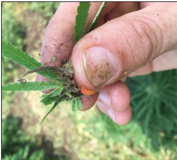
Figure 3. Eurasian hemp borer, photo by Nicholas McNeely.

The most common pests reported in hemp were aphids and borers, especially the European corn borer and the Eurasian hemp borer. Aphids were well controlled by insect predators such as ladybugs and lacewings. European corn borers and the Eurasian hemp borer were harder for growers to control when they did infest a field. The European corn borer develops in the main stalk and larger stems and causes wilting of major portions of the plant. Eurasian hemp borer damage was not seen until later in the season at harvest time. The damage was observed as suddenly browning and dying flower buds. Hemp borer larvae tunnel through the stem into the developing buds, causing the bud to wilt and die. According to the Colorado State University Hemp Resource Center, wild populations of host plants such as feral hemp, smartweeds, and knotweeds are sources of this pest, and the caterpillar overwinters in stalks, leaves, and seed heads.