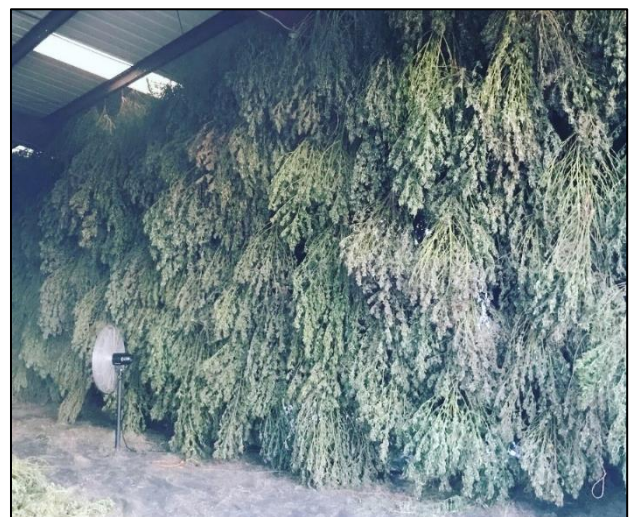
Figure 5. CBD-type hemp plants hanging to dry, photo by Hemp Acres LLC.

CBD hemp growers that harvested by hand hung the plants indoors to dry and cure the flowers. Air flow and dehumidifiers were necessary to prevent mold from developing in the flower heads, depending on ambient air humidity. After curing, the flowers were then stripped off the stalks by hand or with a bucking/trimming machine, and the dried biomass was stored in super sacks. CBD hemp growers that machine harvested experimented with silage choppers, combines, and chippers/shredders. The harvested biomass was then dried in full-floor grain bins and on racks with fans and dehumidifiers. At least 10 growers used belt/conveyer dryers to speed up the drying process.