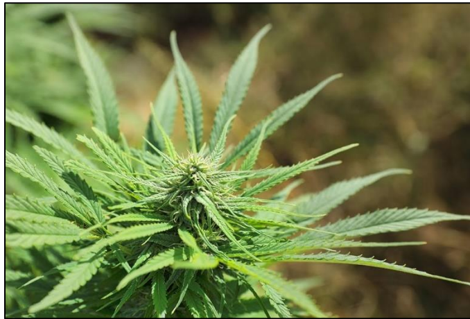
Figure 2. Female hemp flower, photo by Hemp Acres LLC.

Each field is inspected and sampled within 30 days of harvest. To collect a sample, an MDA inspector randomly selects 30 plants per field, cuts the top two inches of the female flowers, and places all 30 cuttings into a paper bag to make a single, homogenized sample. The plant material is then taken to Legend Technical Services Laboratory in St. Paul for THC analysis using High Performance Liquid Chromatography (HPLC). The 2018 Farm Bill and the recently published IFR specifically requires the MDA to look at delta-9 THC concentration post decarboxylation for regulatory purposes, in which the acid form, THCA, is factored into the calculation. This is done in order to determine the total potential of a plant to produce psychoactive effects. Most of the THC found in the plant is in the acid form, and it converts to delta-9 THC by heat or degradation. Total THC is equal to delta-9 THC + (THCA*0.877) when obtained by an HPLC method. In 2019, the average THC concentration across all samples was 0.24%. The average THC level for cannabidiol (CBD) crops specifically was 0.29%; for fiber crops, 0.22%; and for grain crops, 0.10%.