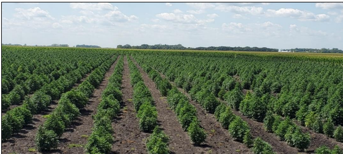
Figure 1. CBD-type hemp field, photo by Kietzer Farms/Journey Organics.

All first-time applicants are required to submit fingerprints to the MDA and pass a criminal history background check. The applicants must register their specific growing and processing locations and pay the annual program fees.