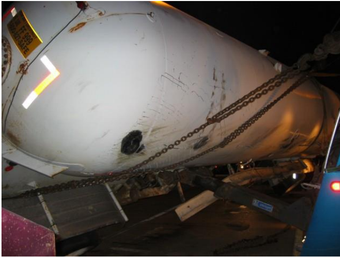
Close-up of tanker damage.