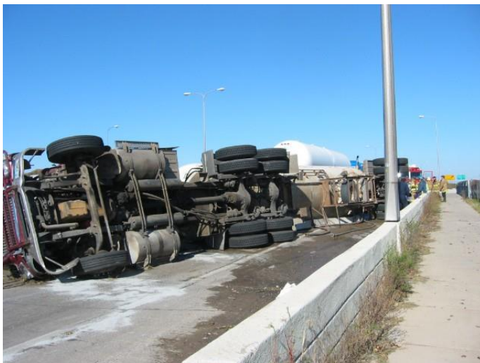
Ammonia tanker on its side during off-loading into another shown in the background.