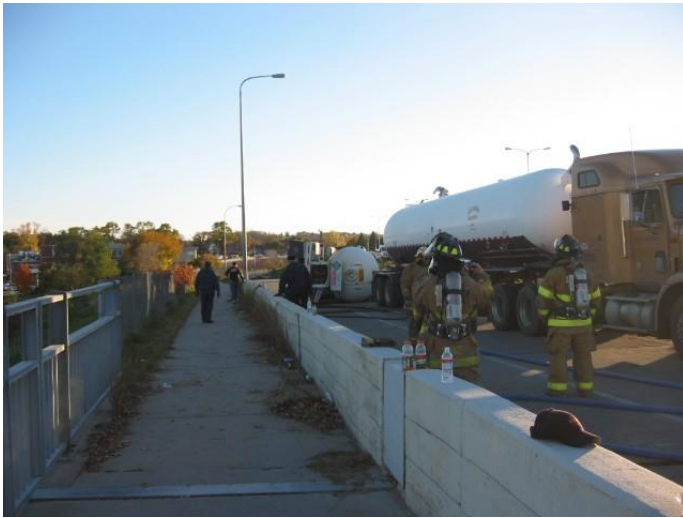
Fire department support during off-loading.