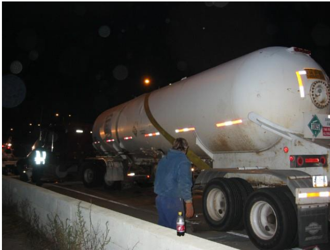
Empty and ready to be towed away for repairs.