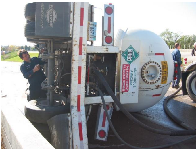
Ammonia rated hoses attached to tanker.