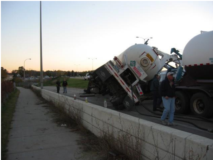
Hoses reattached to tanker to pump out ammonia.