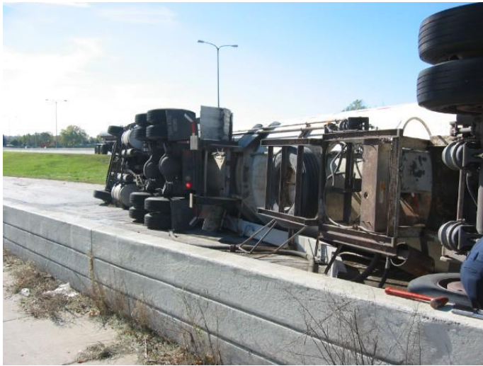
Semi-tractor trailer on its side.

The photographs included in this document were taken by the Minnesota Department of Agriculture during the off-loading and up-righting of a tanker that rolled over just off Highway 169 in Mankato, Minnesota. (October 20, 2005).