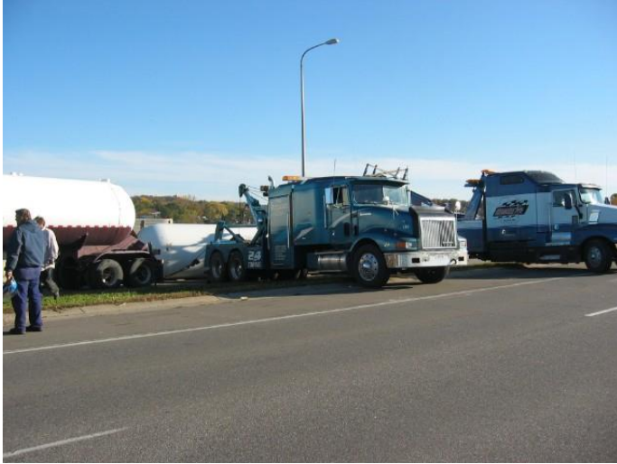
Beginning to up-right tanker.