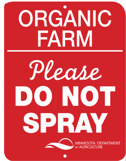
Sign is 18" x 24"

To reduce our cost of distribution, signs may be shipped to your preferred USDA Natural Resources Conservation Service county office for pickup. In this situation, we will notify you when they have been shipped.