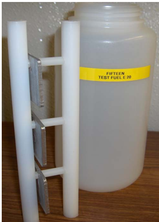
Figure 1. Samples on test stand and bottle

An explosion-proof friction air oven was used to maintain the samples at 45 \pm 2 °C. It uses the heat generated by circulating air to maintain the temperature instead of an element or a flame. This is very important when heating combustible liquids in the presence of oxygen due to the potential for an explosion if the vapors were to come into contact with an ignition source.